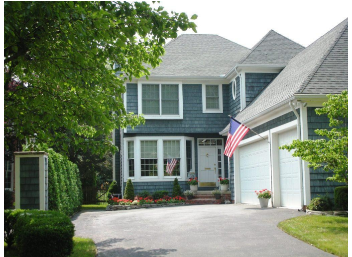
379 St. Clair

Sycamore Lane Homeowners Association - award presented for "Best Block" (pictured below)