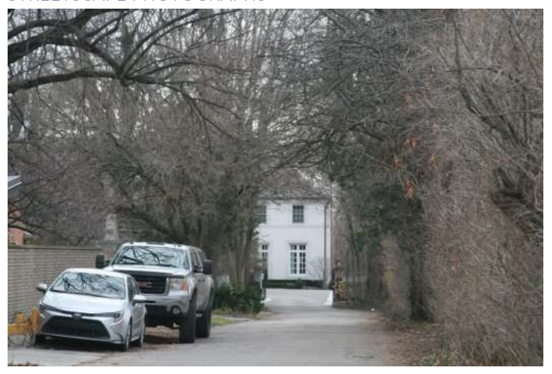
Looking south on Donovan Place