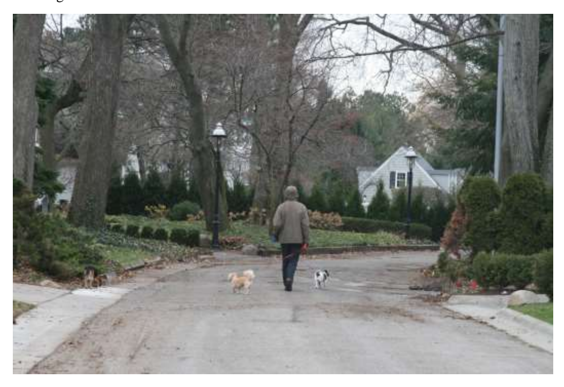
Looking south on Rathbone Place