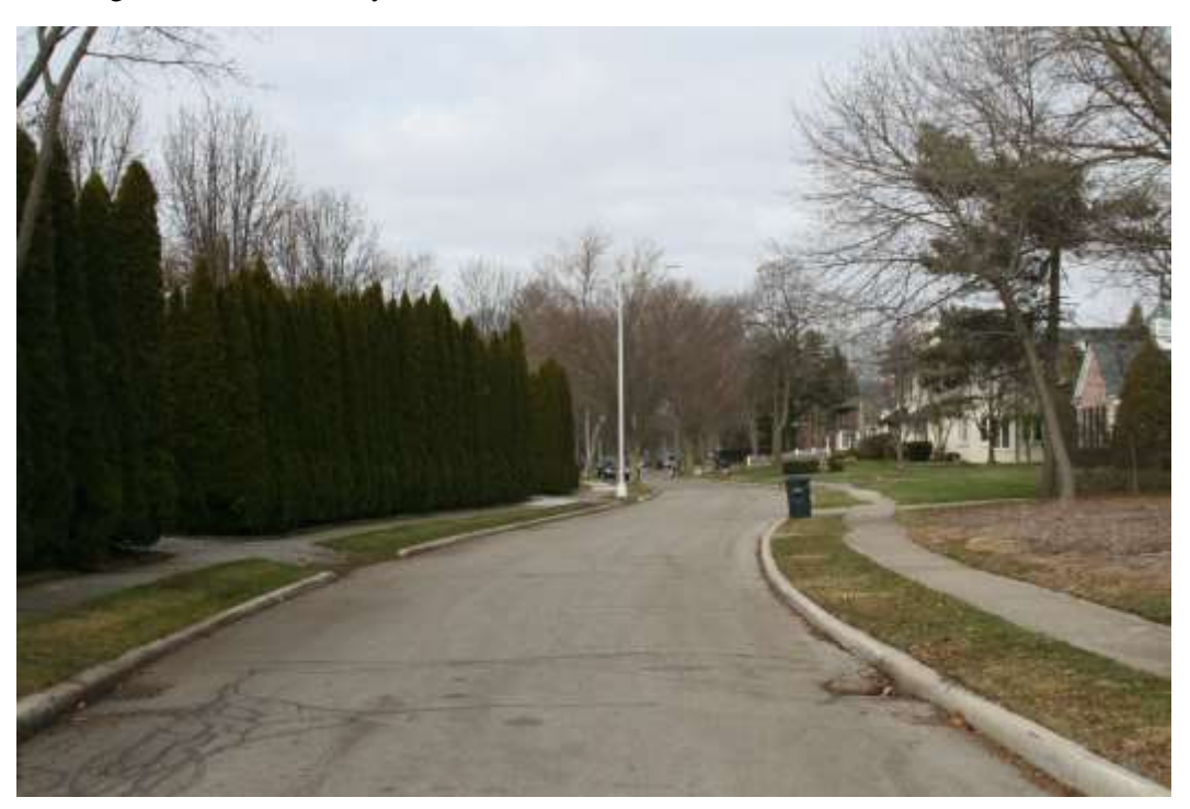
Looking north on University Place from near Jefferson