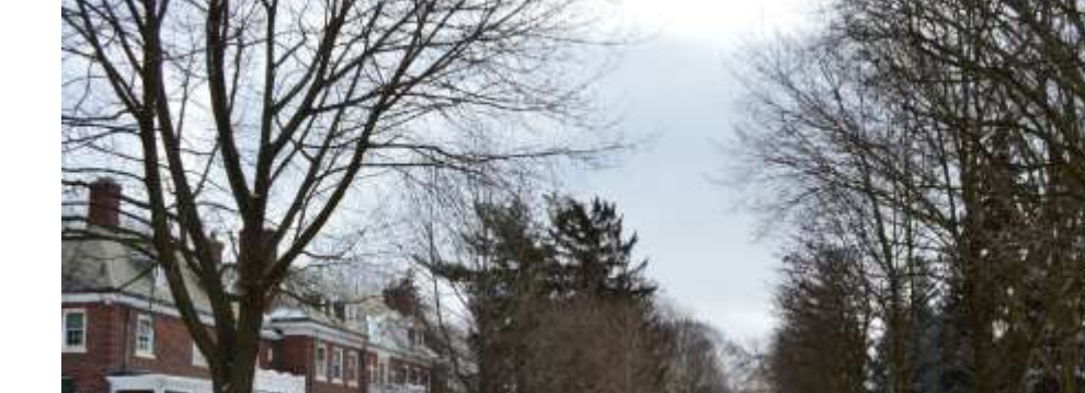
Looking south on Lakeland from near Maumee