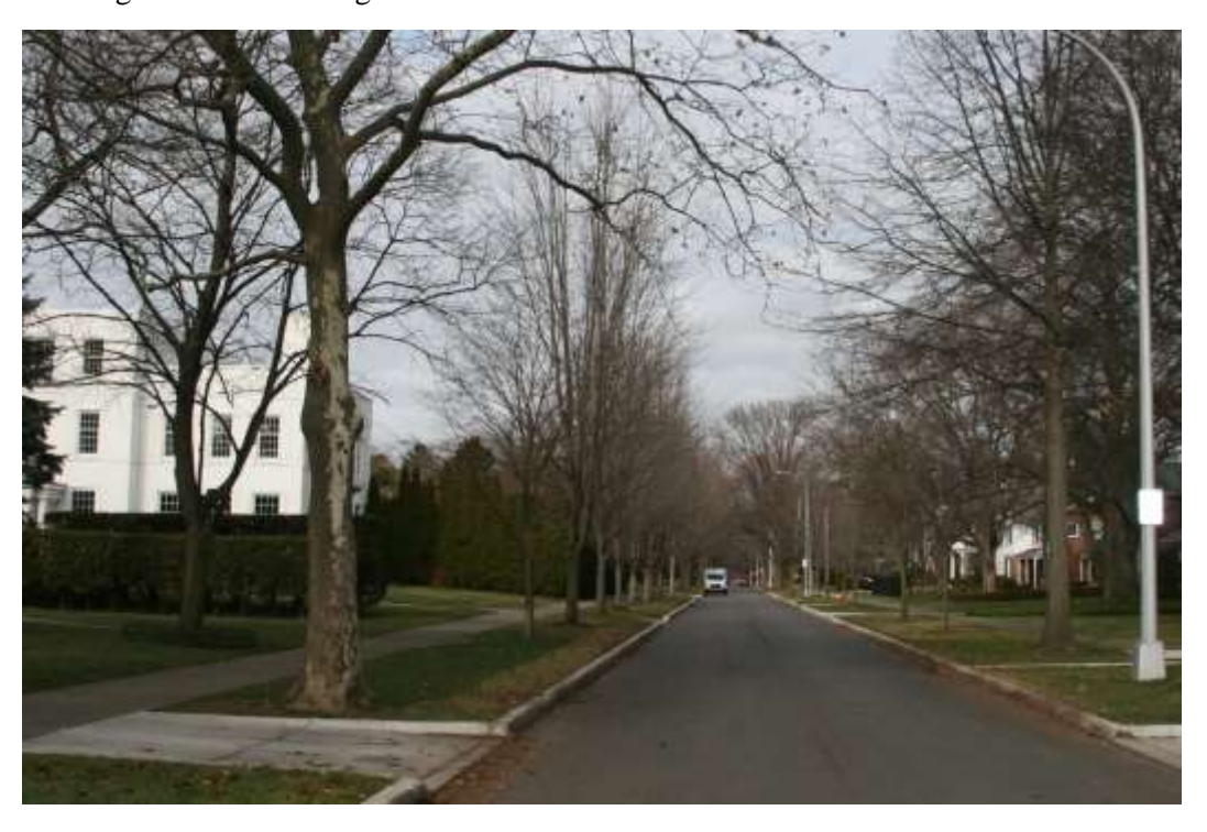
Looking north on Lincoln Road