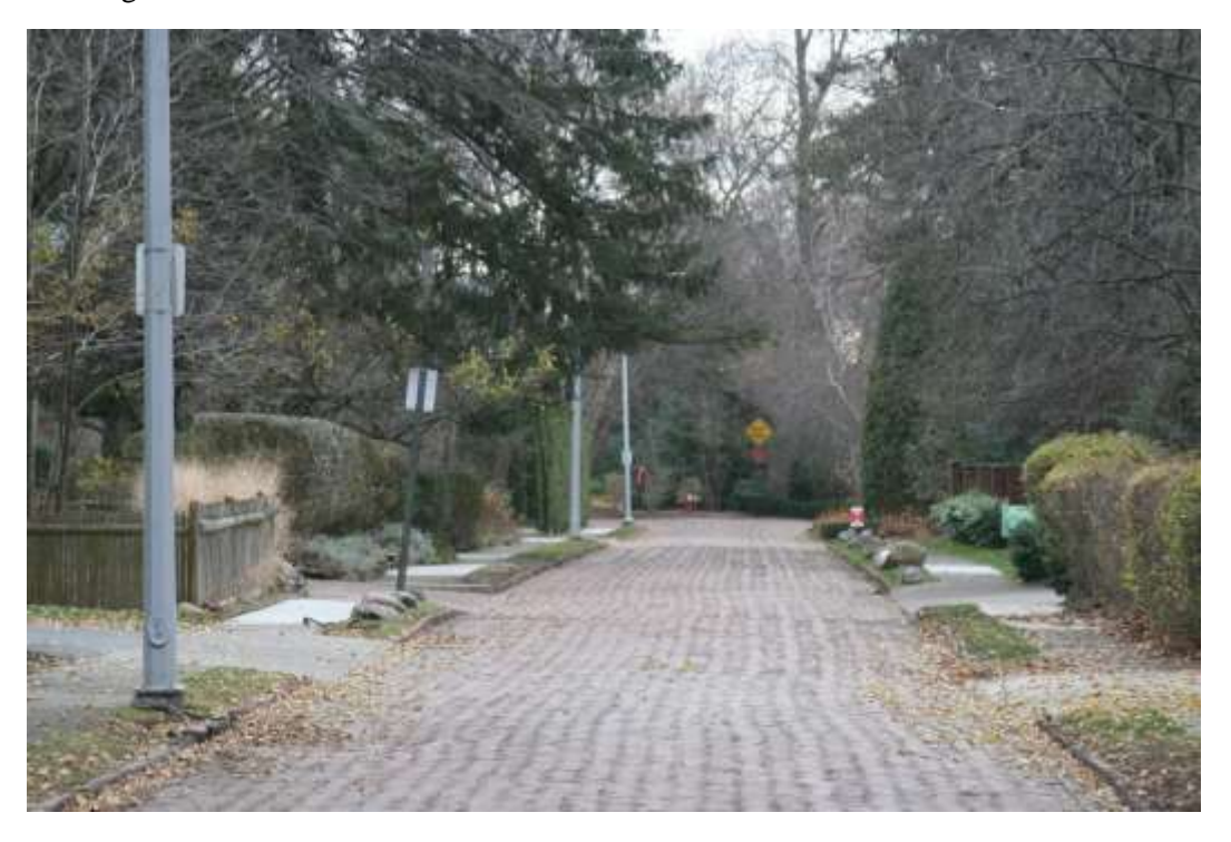
Looking south on Woodland Place