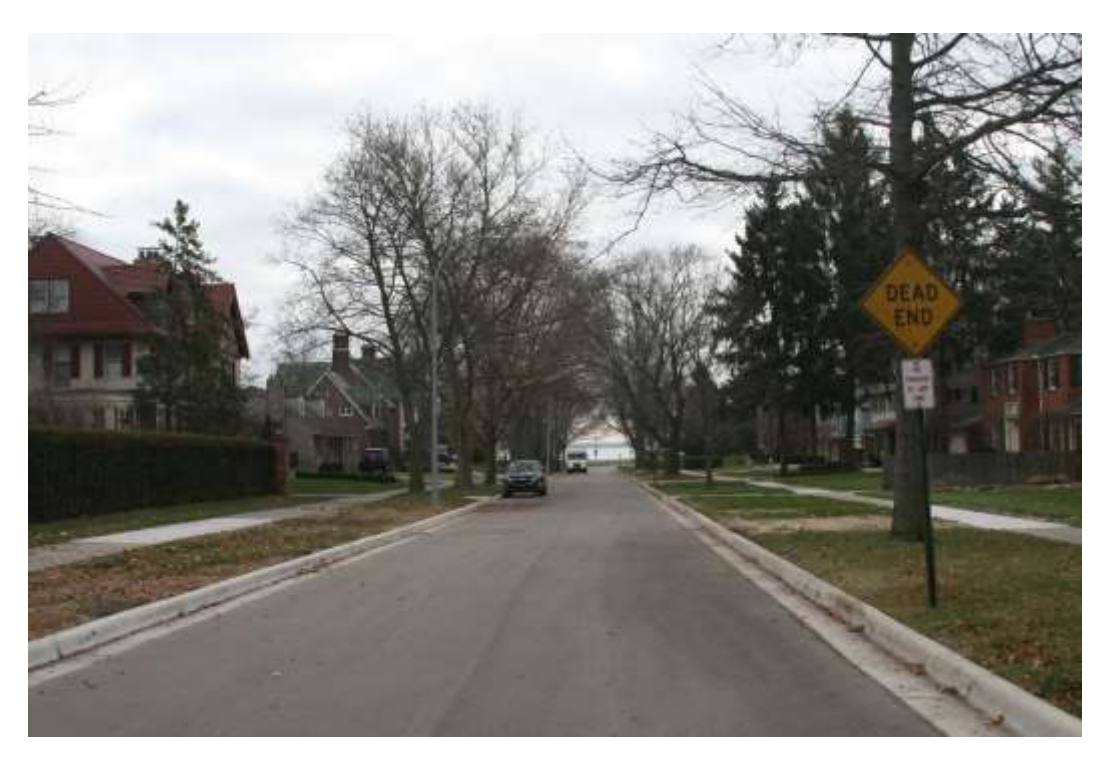
Looking south on Lakeland Avenue