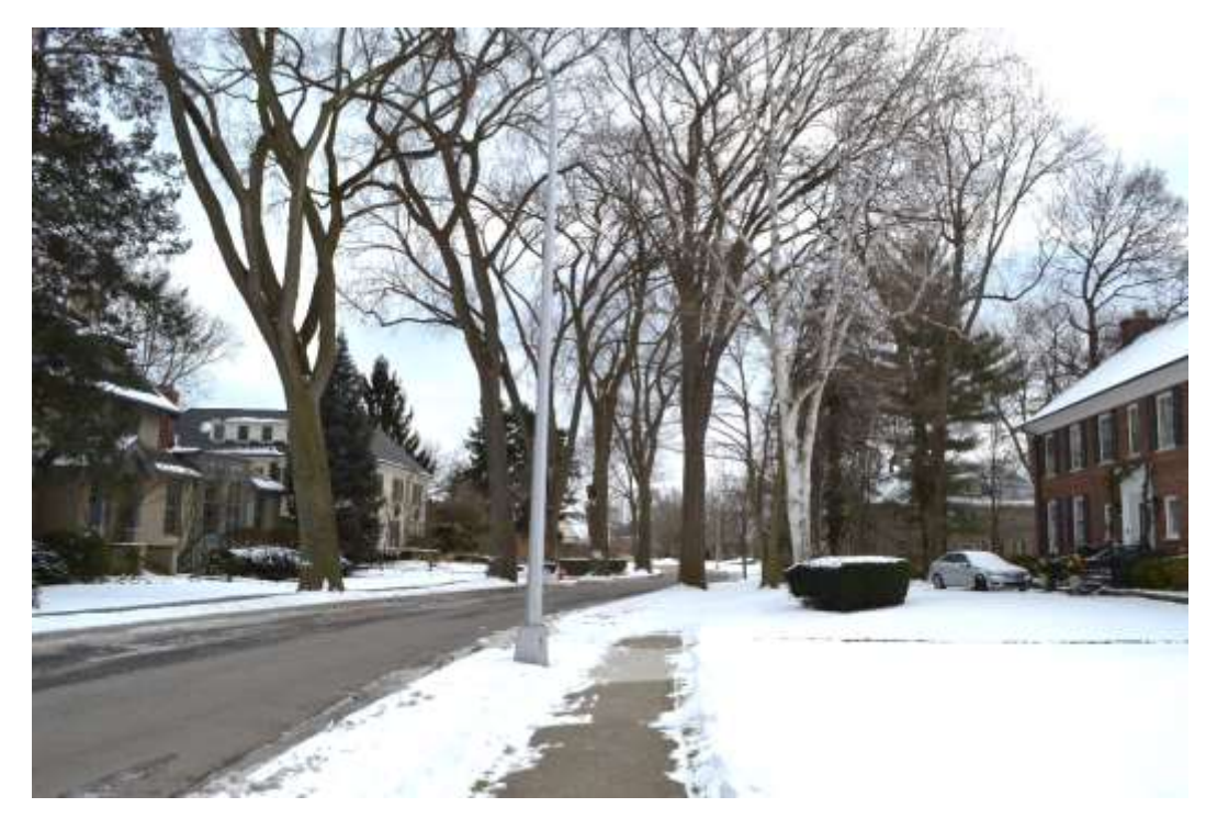
Looking south on University Place from near Maumee