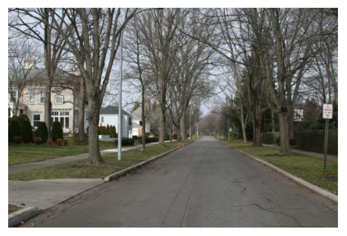
Looking north on Washington Road